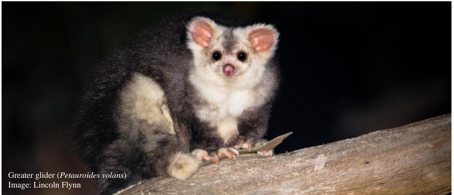
Greater glider ( Petauroides volans )