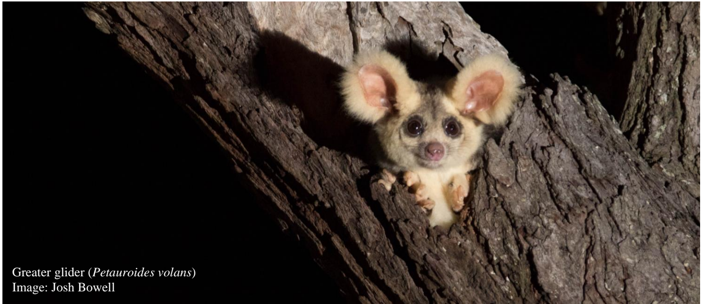
Greater glider ( Petauroides volans )