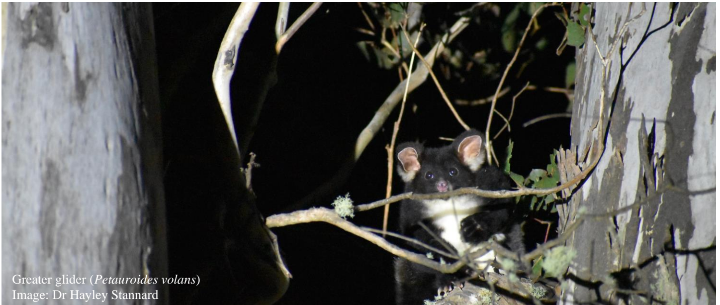
Greater glider ( Petauroides volans)