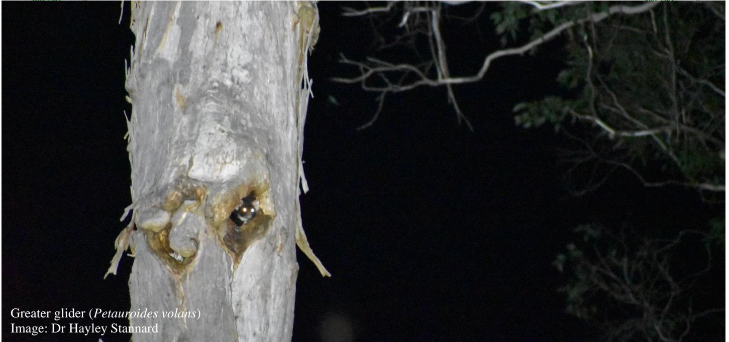
Greater glider ( Petauroides volans)