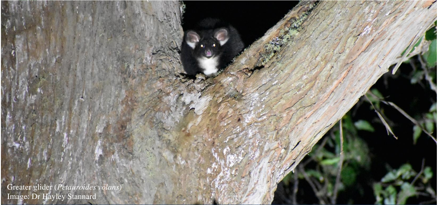
Greater glider ( Petauroides volans)