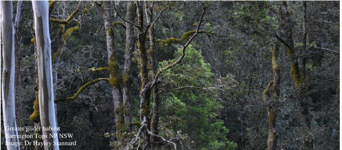
Greater glider habitat Barrington Tops NP NSW