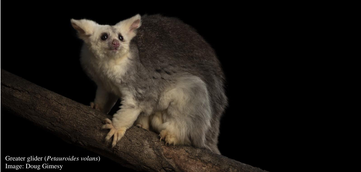
Greater glider ( Petauroides volans )