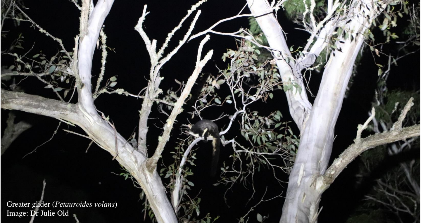
Greater glider ( Petauroides volans)