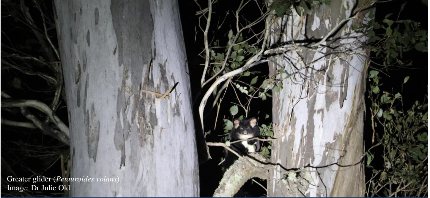
Greater glider ( Petauroides volans)