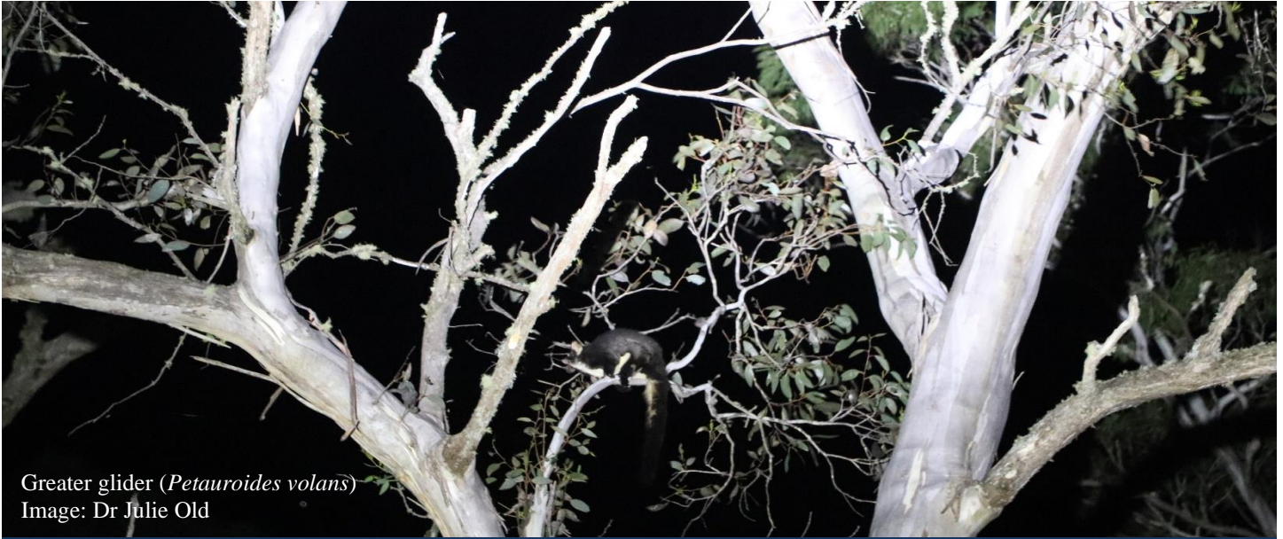
Greater glider ( Petauroides volans)